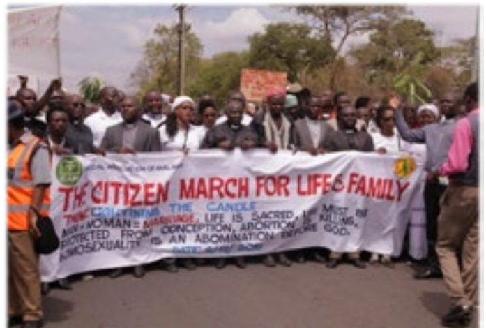
Pro-life demonstrators march through Lilongwe, Malawi.

Probably you have heard how our Republican President Dr Lazarus Chakwera, a former reverend