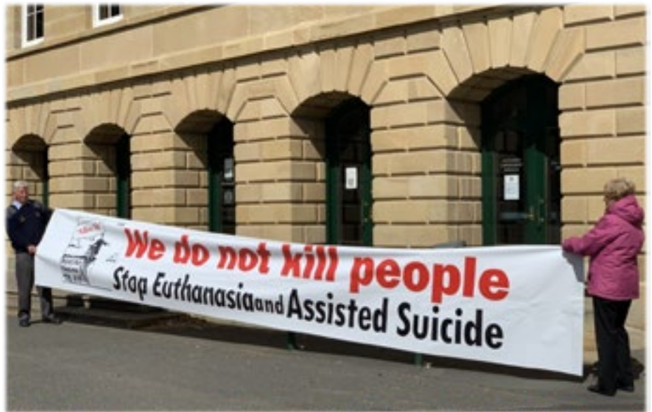
Pro-Life Victoria (Inc) commissioned this banner as one of our contributions to the campaign conducted by fellow Tasmanian pro-lifers against the legalisation of assisted suicide in Tasmania.

silent witness outside Parliament House against patient executions, I had the opportunity to have a conversation with the premier, Peter Gutwein. As in conversations with other MPs, I immediately focused on the fundamental principle, " We do not kill people. " I explained that I was opposed to euthanasia because in every act of euthanasia a physician kills a patient. I did not get my sentence finished, before Mr Gutwein interrupted me saying, " It is not about killing at all! It is just about assisting a person to die. "